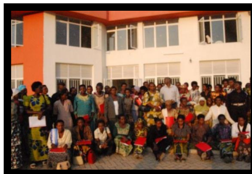
Delegates outside of the centre

The centre continues to be open to use for all survivor's organisations, for relevant programmes. In time it is hoped to make the centre a permanent base for programmes developed, managed and for the benefit of survivors.