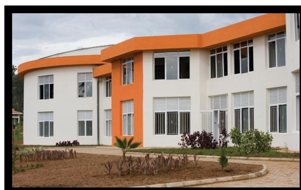
Frontal view of the two-storey centre

For further information visit: www.survivors-fund.org.uk