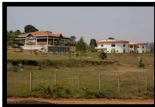
The Site of the Centre

Since completion, the centre has housed for a time the offices of SURF Rwanda, as well as hosted a number of seminars and workshops on issues and programmes related to survivors in Kamonyi and the Southern Region. Most recently a series of training sessions were staged at the centre as part of a gender-based violence programme funded by the Sigrid Rausing Trust.