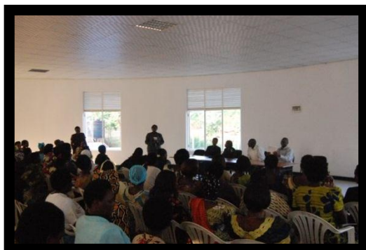
A training session in the Conference Hall

Since completion, the centre has housed for a time the offices of SURF Rwanda, as well as hosted a number of seminars and workshops on issues and programmes related to survivors in Kamonyi and the Southern Region. Most recently a series of training sessions were staged at the centre as part of a gender-based violence programme funded by the Sigrid Rausing Trust.